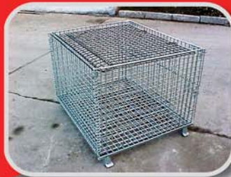
hinged lockable lids