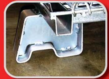
heavy duty feet