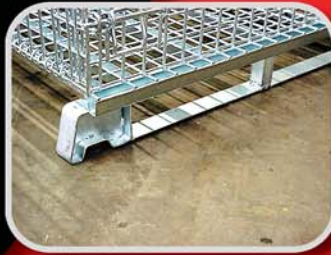
pallet runner bars