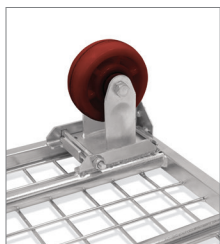
Standard caster pad design for easy assembly and maintenance