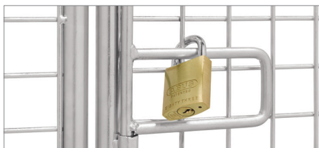
Folding latch securely closes cart (padlock not included)